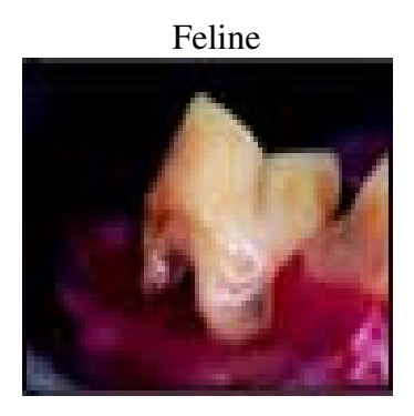
Stage Five : As the bone and surrounding dental tissues die, the tooth loses its attachment, loosens and eventually falls out.